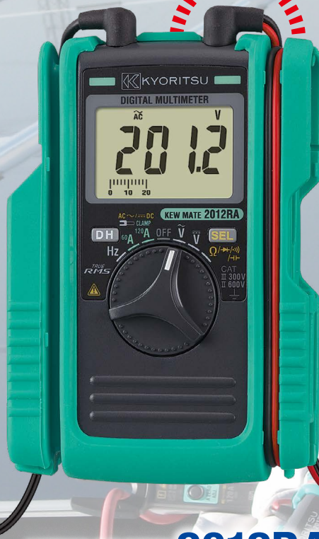
KEW MATE 2012RA CE