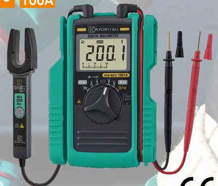
KEW MATE 2001A CE