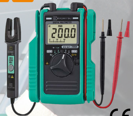
KEW MATE 2000A CE